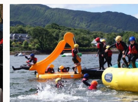
Star Outdoors Water Sports Centre in Kenmare