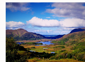
Looking north towards the lower lake and Killarney

South and west of Killarney in Co. Kerry is an expanse of rugged mountainous country. The McGillicuddy's Reeks, the highest mountain range in Ireland, rise to a height of over 1000m. At the foot of these mountains nestle the world famous lakes of Killarney. Here where the mountains sweep down to the lake shores, their lower slopes covered in woodlands, lies the 26,000 acre Killarney National Park. The distinctive combination of mountains, lakes, woods and waterfalls under ever changing skies gives the area a special scenic beauty.