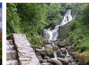
Torc Waterfall from the viewing point