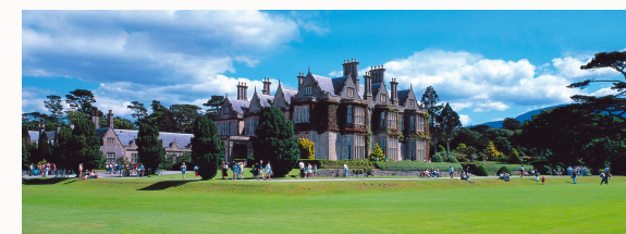
Muckross House and Gardens, are immediately accessible on entrance to the National Park, near the Venture Centre.